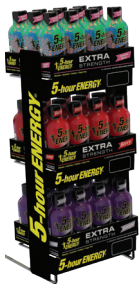
3-box rack: Essentials