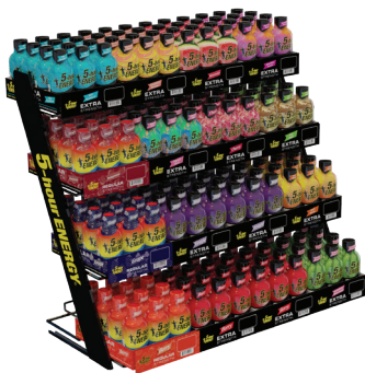
16-box rack: Super Selection