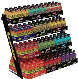
15-box rack: Super Sellers