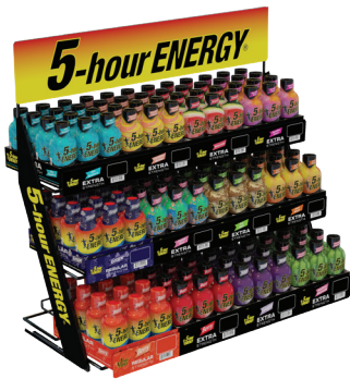
12-box rack: Flavor Seekers